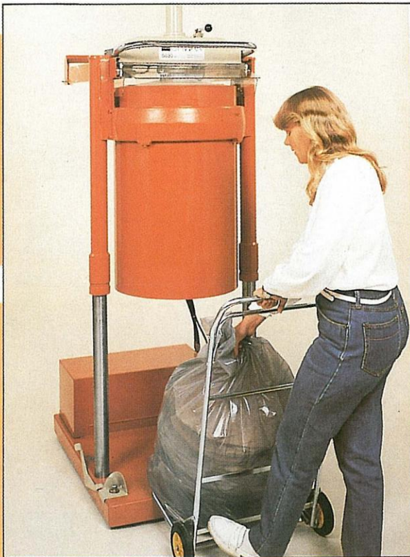
3. The process is repeated until bag is full, leaving a neat, easy to handle, hygienic pack.