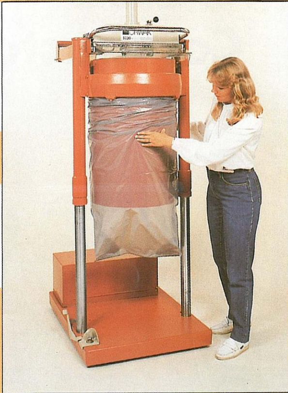
1. A sack is fitted to the drum when raised.